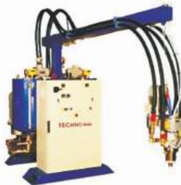
Puf Insulation Machine