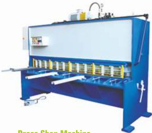
Press Shop Machine

Our advanced infrastructure facilities help us in carrying out the business operations in most professional and organized manner. We make use of latest machinery to conduct large scale production and meet the bulk needs of our esteemed clients. Servicing these machines at regular intervals helps in maintaining the standard efficiency. Following are some of the plants and facilities we are equipped with: